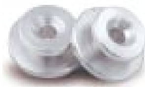
Item: SP25BK Description: MOUNTING BUTTON 2.5MM KIT SET OF 4 USE WITH ALL TOWRAX PRODUCT ((((((EXCEPT SP45HFTA TABLE))))))