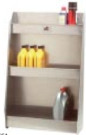
Item: SP36CCA Description: COMBO CABINET 3 SHELF UNIT 36"Hx25.5"Wx9"D STORE ALL YOUR FLUIDS AND LUBRICANTS ON THIS SHELF TOP SHELF FOR AEROSOL CANS MIDDLE FOR QT. SIZE CONTAINERS AND BOTTOM SHELF IS PERFECT FOR GALLON CONTAINERS.