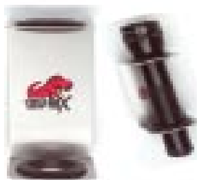
Item: SP135FLHOA Description: FLASHLIGHT HOLDE R ALUMINUM INSTALL ANYWHERE 5.25"H X 2.75" W X 2.75"D HOLES WITH GROMETS