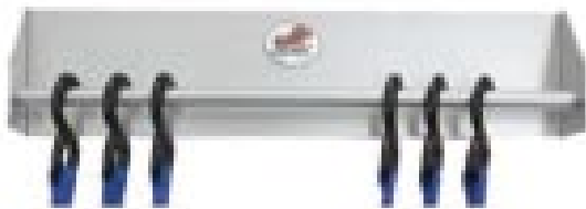
Item: SP25SHA Description: STRAP HANGER 4.5"Hx 17"Wx3"D NO MORE TANGLED STRAPS OR BUNGEE CORDS THIS IS THE PERFECT WAY TO HANG THEM SOLD EACH USE TWO TO HOLD THEM EVEN BETTER ONE ON TOP AND ONE ON BOTTOM ABOUT 2' APART OR SO