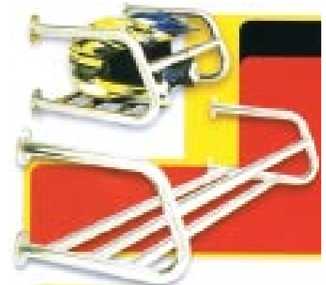
Item: SP48HR Description: SS TUBULAR GEAR SHELF 48" 12.6"H x 49.9"L x 16.3"D