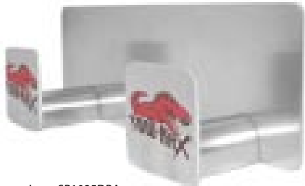
Item: SP1025DBA Description: DOUBLE BRKT ALUMINUM HANGER USE F OR GOGGLES, TAPE ROLLS, SMALL CORDS, OR EVEN JACKETS. 3.5"H x 10.25"Wx 2.5"D