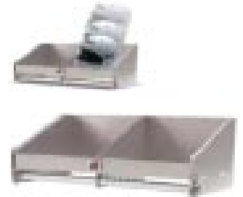
Item: SP280HSA Description: DOUBLE SHELF SIDE BY SIDE ALUMINUM FOR HELMETS, BOOTS OR CLOTHES. 10.5"H x 28"W x 15"D HANGER BAR UNDERNEATH CAN BE REMOVED