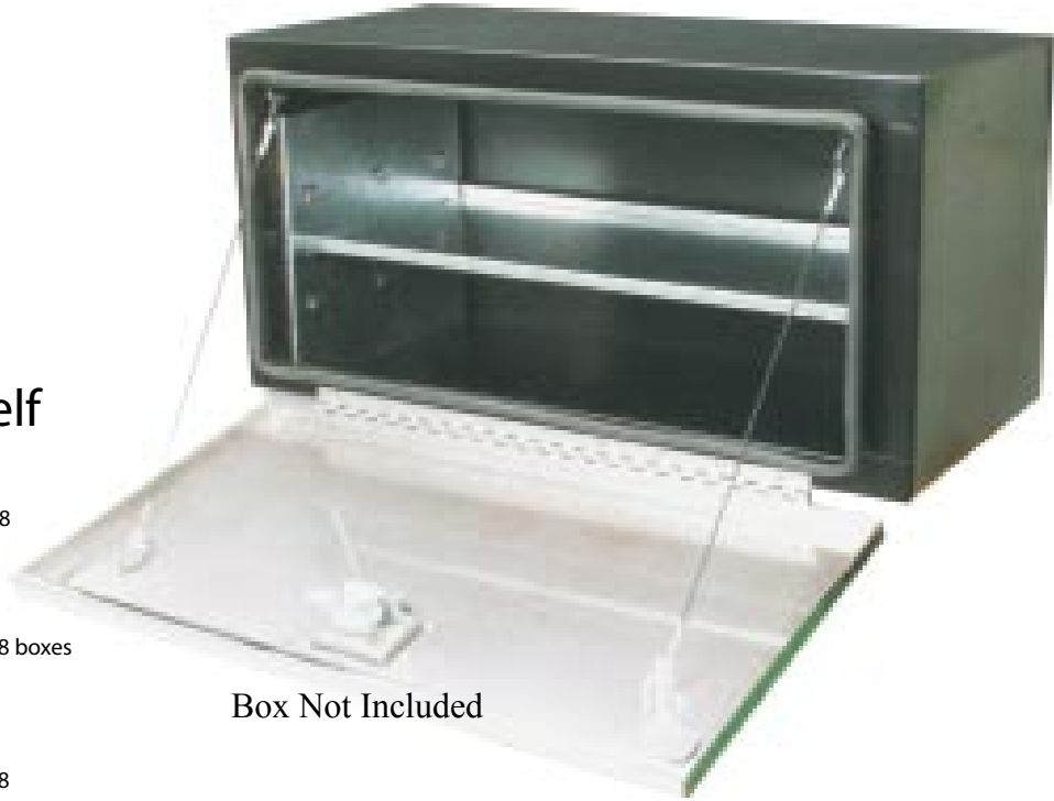
Box Not Included

Item: SUSD48SK Description: 48" W TOOL BOX SHELF ADJ FITS 18x18 GALV STEEL