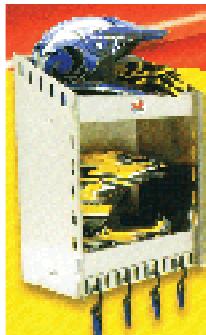
Item: SPCHH Description: CORNER HELMET SHELF ALUMINUM 21"Hx14.25"W x 15.75"D STORE 2 HELMETS & PLACES TO HANG ITEMS ALSO