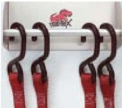
Item: SP8SHA Description: STRAP HANGER 4.5"Hx 8"Wx3"D NO MORE TANGLED STRAPS OR BUNGEE CORDS THIS IS THE PERFECT WAY TO HANG THEM SOLD EACH USE TWO TO HOLD THEM EVEN BETTER ONE ON TOP AND ONE ON BOTTOM ABOUT 2' APART OR SO