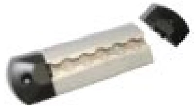
Item: SPPGF Description: FLOOR TRACK END CAP SOLD EACH