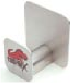
Item: SP35SBA Description: SINGLE BRKT ALUMINUM HANGER FOR ODDS AND INS 3.5"H X 3.5"W X 2.5"D