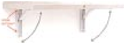
Item: SP45HFTA Description: FOLDING TABLE TOP 45"L X 18"WX3"D SET APPROX 4" FROM WALL WHEN FOLDED DOWN, WORKING CAPACITY IS 100lbs. CAN BE EASILY REMOVED FROM THE INSIDE WALL AND REMOUNTED ON THE EXTERIOR WALL WHEN THE EXTRA MOUNTING BUTTONS ARE USED. 2 SETS OF BUTTONS COME WITH EACH TABLE, FOR MORE ORDER PART# SP30BK