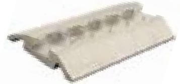
Item: 49363-10-72 Description: LOW PROFILE FLOOR TRACK 2.6"Wx72"Lx 0.5H MOUNTING SCREWS NOT INCLUDED TIE DOWN RINGS NOT INCLUDED