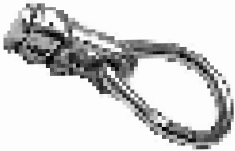
Item: 47556-11 Description: TIE DOWN RING DOUBLE STUDDED SPRING LOADED TRACK FITTING BS 5000lbs WLL 1,666lbs LOAD VARIES WITH ANGLE OF LOAD SOLD EACH