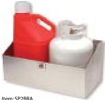
Item: SP2BRA Description: DUAL JUG RACK ALUMINUM 12"H x25"W x 12.5"D SAFELY HOLD 2 PROPANE OR FUEL JUGS FROM SLIDING AROUND