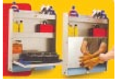
Item: SP30CDS Description: STORAGE CABINET W/FOLD DOWN TRAY STAINLESS STEEL MIRROR POLISHED BACK 3 SHELF + PAPER TOWEL HOLDER THAT IS SPRING LOADED TO PREVENT UNROLLING 30"Hx25.5"Wx9"D